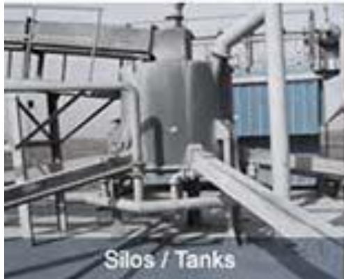
Silos / Tanks