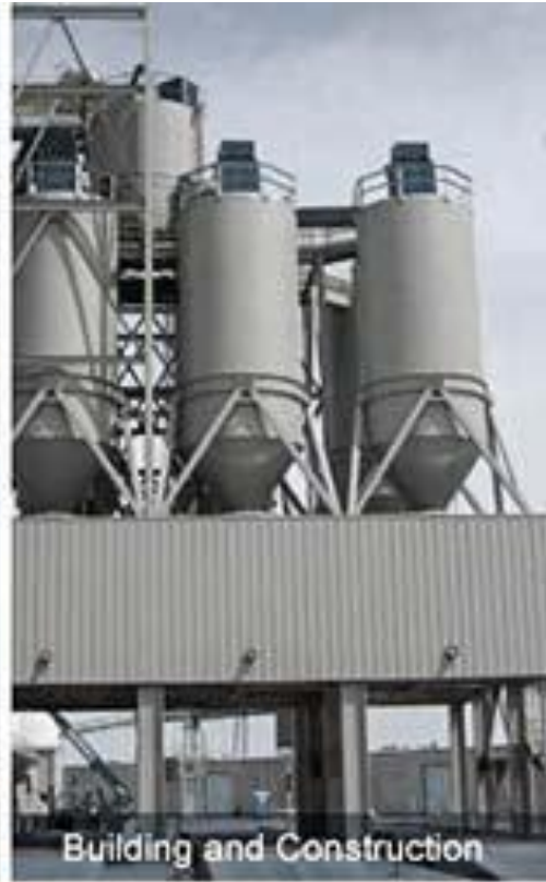
Building and Construction